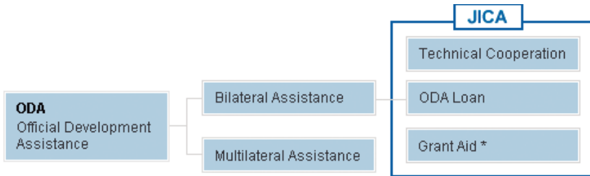
Figure 2: Japan's ODA

*This excludes Grant Aid which the Ministry of Foreign Affairs will continue to directly implement for the necessity of diplomatic policy.